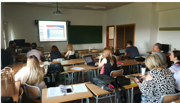
Picture 1: EUPA_NEXT Learning Activity 2 (TRAIN THE MASTER TRAINER) in Spain

This deliverable is the ISO accredited materials for EUPA levels 2,3,4 and 5. The term training materials refers to the materials that were used in classroom training and include the trainers detailed Power-Point presentation and innovative methodological tools which contained written exercises/open ended questions and multiple choice questions, role plays, simulation exercises, case study analysis etc. A desktop research was made by the partners in order to help them prepare for the development of materials. The development materials of levels 3,4,5 in all the languages of the consortium, has followed. The certification of the training materials of levels 2,3,4 and 5 was implemented by the Cyprus Certification Company (CCC).